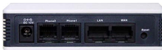
ATA171plus front and rear view Color : Gray